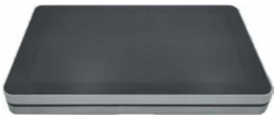
Standard version enteliVIEW-10 SILVER