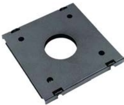
VESA wall mount adapter