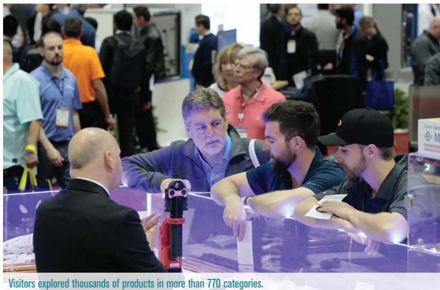
Visitors explored thousands of products in more than 770 categories.

BACnet SC is an additional data link option in BACnet, said McMillan, adding “it’s the same BACnet.” BACnet users can pick between IP and MS/TP as two different ways to transport data. Secure Connect is another option to transport data, he said. The implementation is not extreme, and people who